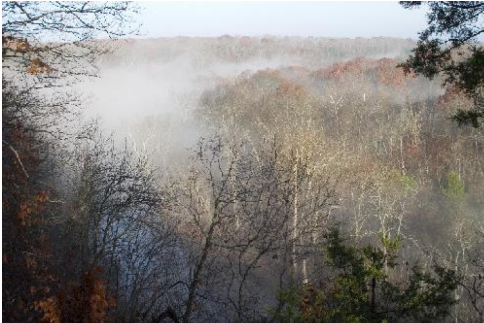
View of the Epple Tract, where logging and development are proposed

The "Southwest Project" addresses a wide range of proposed management activities across nearly 6000 acres of the Cedar Creek District. Most of the project calls for a variety of forest management and development that many would consider excessive, but our immediate focus must be the specific projects proposed for the northwestern portion of the de-facto Smith Creek wilderness, an area referred to as the "Epple Tract".