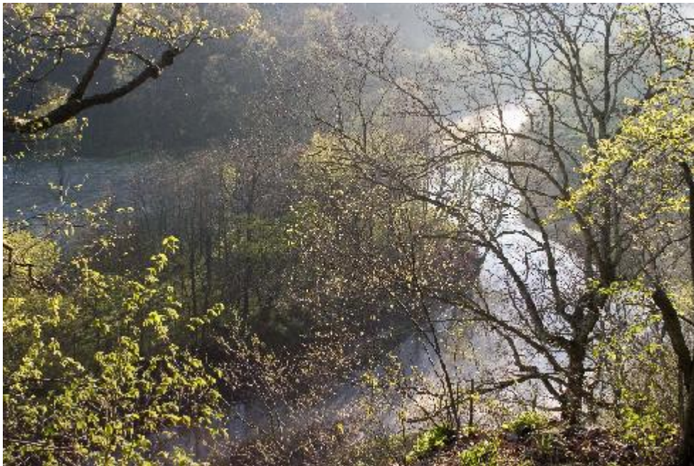
Smith Creek Proposed Wilderness

Situated in the midst of mid-Missouri's population centers of Columbia, Fulton, and Jefferson City, the Cedar Creek District of the Mark Twain National Forest is much-used and much-beloved. And no portion of the Cedar Creek District is more special or better loved than the beautiful and still surprisingly remote Smith Creek Wilderness above and below the old Rutherford Bridge connecting Boone and Callaway Counties. For more than 25 years conservationists have worked with the Forest Service to respect and protect the authentic wilderness character of Smith Creek's streams, bluffs, pinnacles, forests, wildlife, and solitude. In 2007 Smith Creek (2,195 acres) was included in a statewide proposal along with six other Missouri areas for designation as a federal Wilderness Area.